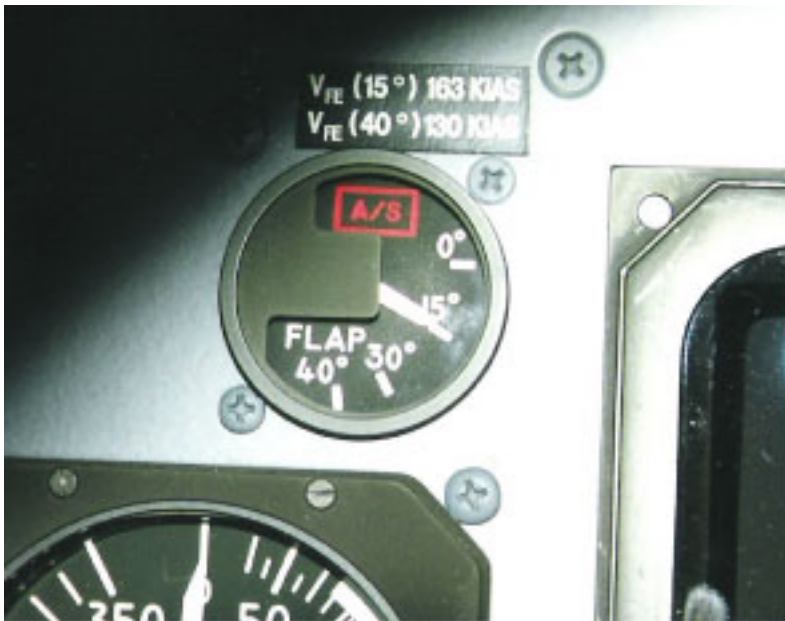
Overspeed indicator MSN 101-888

Now I know that none of the PC 12 drivers would ever do such a thing [overspeed] but just in case, don't make a habit of extending the flaps above the approved speed for position. You should report these overspeeds when you visit maintenance (note to NG drivers-the CAS-CMS records all!), but if you have short-term memory loss this is one of the reasons why the Feds/Pilatus require checks of Flap Systems like this one.